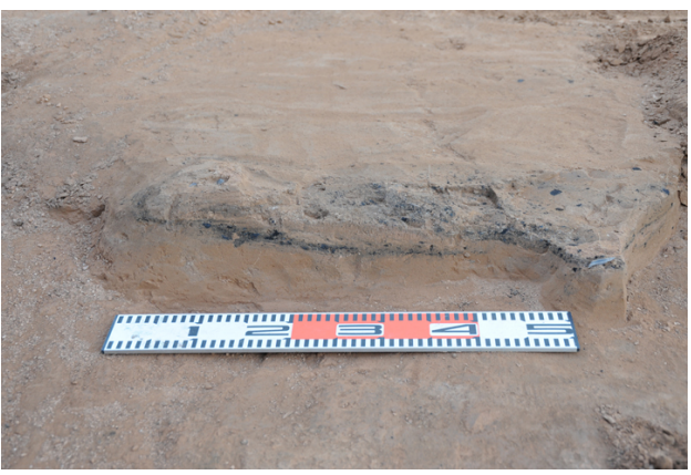
Concentrated charcoal that seemingly originated from the remains of a hearth