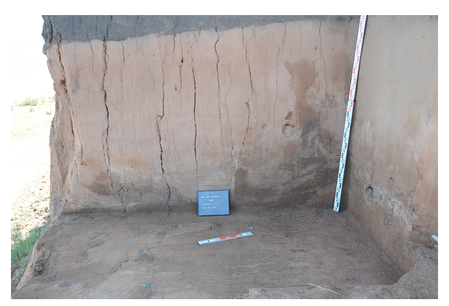
The state of unearthed artifacts and mammal fossils of the paleosol layer