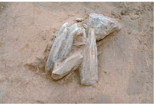
Cheek tooth row of a horse unearthed from the paleosol layer