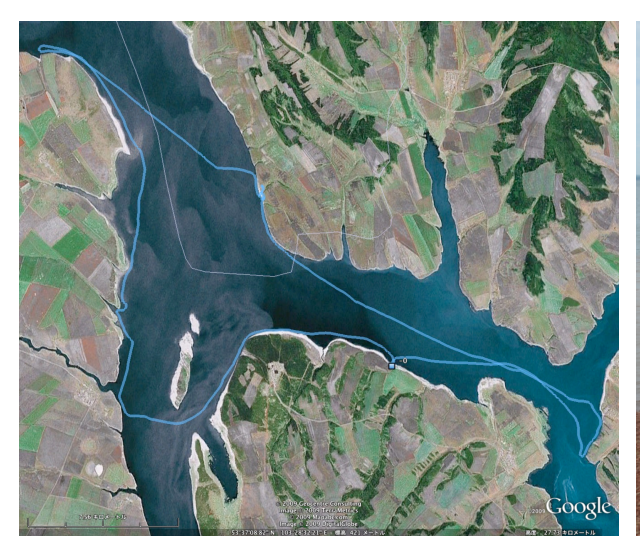
The ship route for the field trip of sites