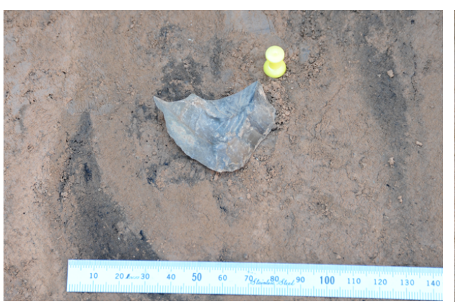
Stone tool unearthed from the paleosol layer