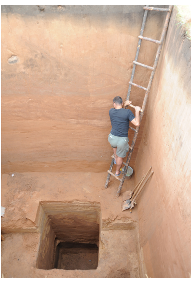
The picture of soil layers at a test excavation site