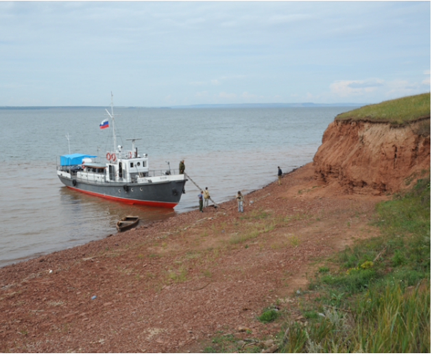
Survey of Krasni Yar site