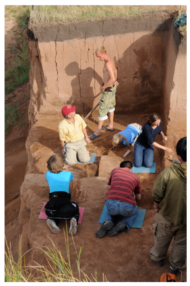
The excavation scene of the palosol layer