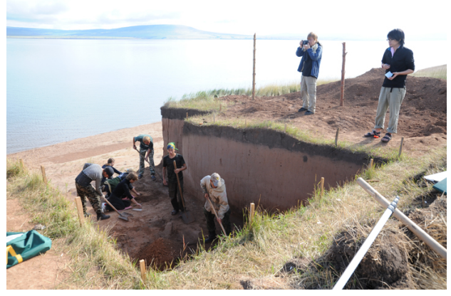
Excavation locations in 2009