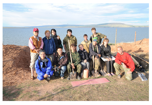
The survey team consisting of researchers, graduate students and students from three countries (Russia, China and Japan)