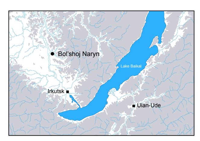
The location of Bol'shoj Naryn site

At the Institute of Archeology and Ethnography in Irkutsk city, we had opportunities to investigate specimens unearthed from Gerasimov site and Sedova site. These are examples of human sites of the Upper Pleistocene that were excavated during the course of city redevelopment. We conducted radiocarbon dating at the University of Tokyo on charcoal and mammal fossils unearthed this year from Bol'shoj Naryn site. Radiocarbon dating was also used to date parts of the excavated mammal fossils from these two sites.