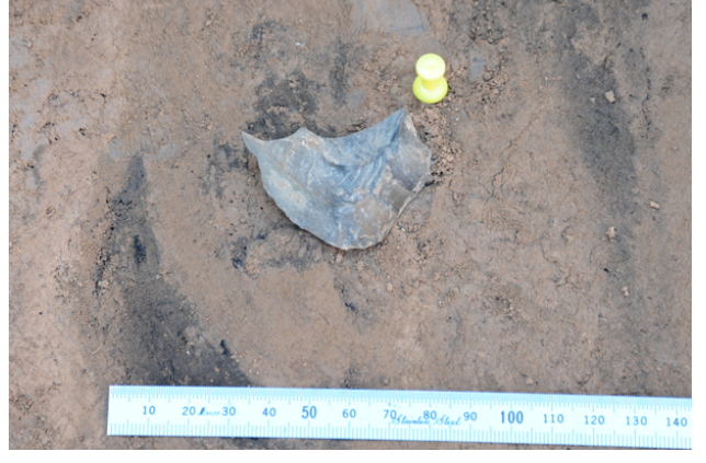
Stone tool unearthed from the paleosol layer