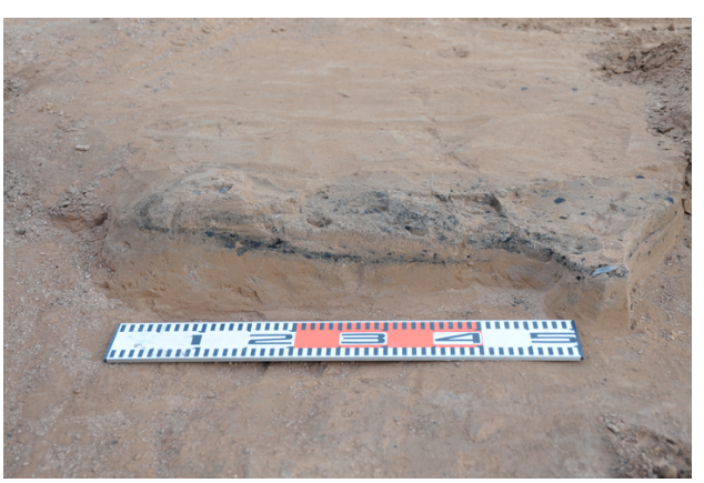
Concentrated charcoal that seemingly originated from the remains of a hearth