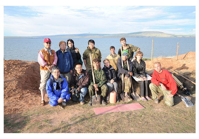
The survey team consisting of researchers, graduate students and students from three countries (Russia, China and Japan)

Bone implements unearthed from the paleosol layer