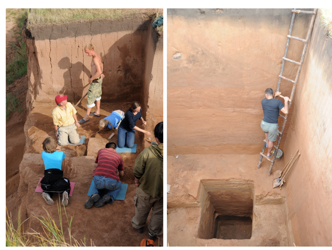
The excavation scene of the palosol layer