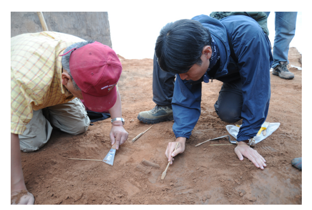
The excavation scene of the paleosol layer