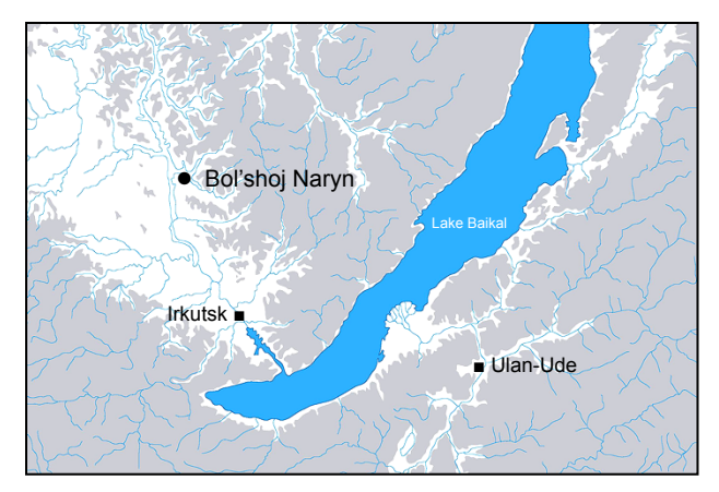
The location of Bol'shoj Naryn site

At the Institute of Archeology and Ethnography in Irkutsk city, we had opportunities to investigate specimens unearthed from Gerasimov site and Sedova site. These are examples of human sites of the Upper Pleistocene that were excavated during the course of city redevelopment. We conducted radiocarbon dating at the University of Tokyo on charcoal and mammal fossils unearthed this year from Bol'shoj Naryn site. Radiocarbon dating was also used to date parts of the excavated mammal fossils from these two sites.