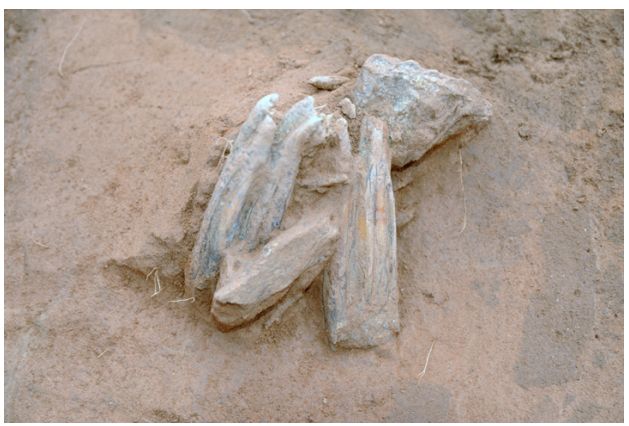
Cheek tooth row of a horse unearthed from the paleosol layer