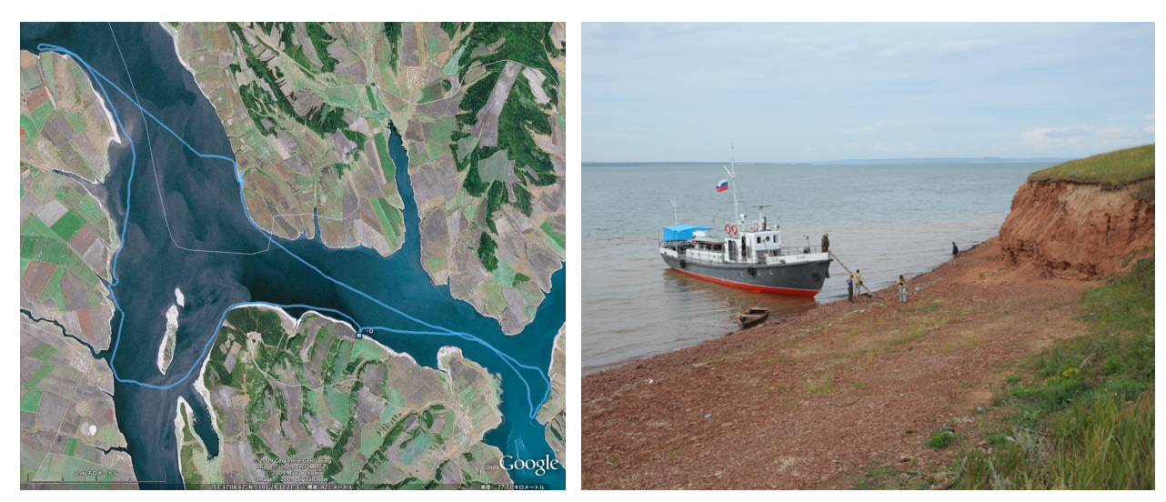
The ship route for the field trip of sites