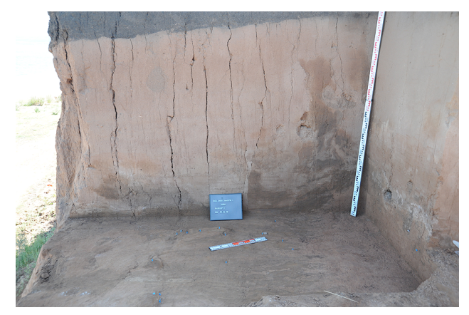
The state of unearthed artifacts and mammal fossils of the paleosol layer